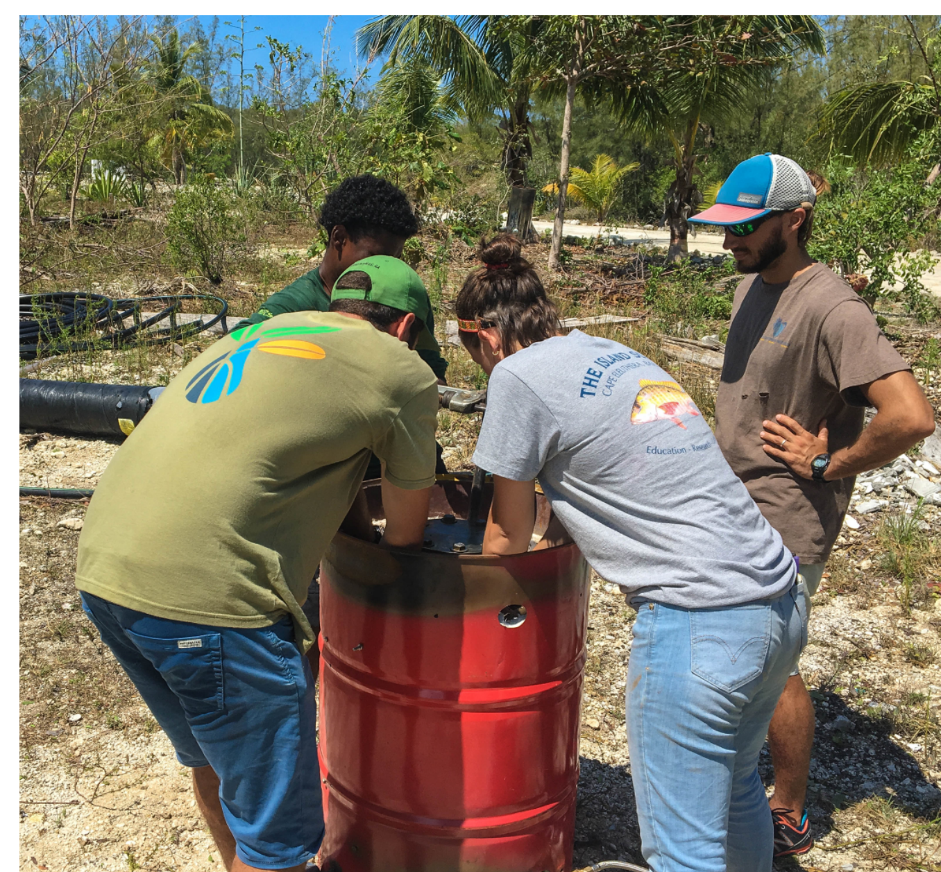
Figure 4: Testing the system

Waste plastic is put into the reaction vessel and is sealed shut to minimize oxygen in the reaction. The reaction vessel rests within an insulated barrel, and the reaction vessel is heated using a propane heat source. The plastic within the vessel vaporizes up the pipe into the condenser. Within the condenser, water, from the tank, surrounds the pipe, condensing the plastic gas into an oil that gets collected in the collection vessel. There are some gases that do not properly condense. The bubbler is a vessel that is filled with water and has a flare at the top. This flare burns off the non-condensable gases from the reaction. Burning off a small amount of CO 2 from the system is far better than the gases that plastic would emit in a landfill, such as methane (27 times worse than CO 2 ) or dioxins (10,000 times worse than CO 2 ).