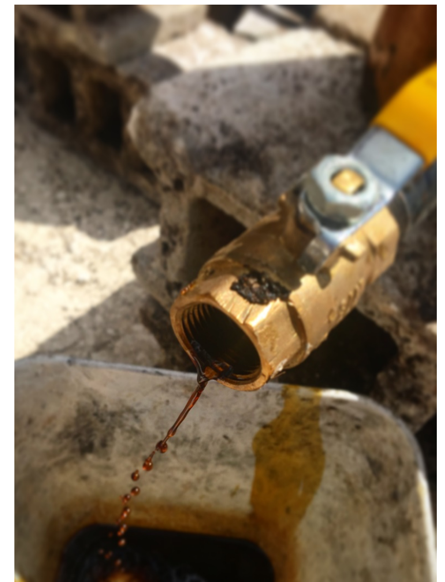
Figure 8: Syn-fuel yield