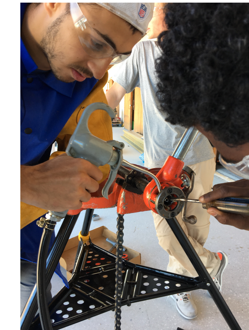
Figure 6: Pipe threading

One of the things that must be kept in mind during analysis are the calorific values of the process. The energy and money ratios on each end must be measured to ensure that more value is being gained from pyrolysis than is being used to run the reaction. There is a theoretic 4000% energy conversion rate, which means that with one unit of energy inputted, 40 units of energy can be yielded. Part of this research process includes evaluating how close the efficiency can get to that 4000% conversion rate. For The Island School, running the pyrolyzer twice a week will deal with the weekly waste stream, and the pyrolyzer will pay itself off in two years. With the amount of waste The Island School produces annually, one half of one Island School van can run off the amount of syn-fuel that can be yielded from that plastic waste.