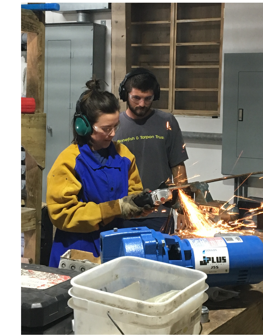
Figure 7: Angle grinding