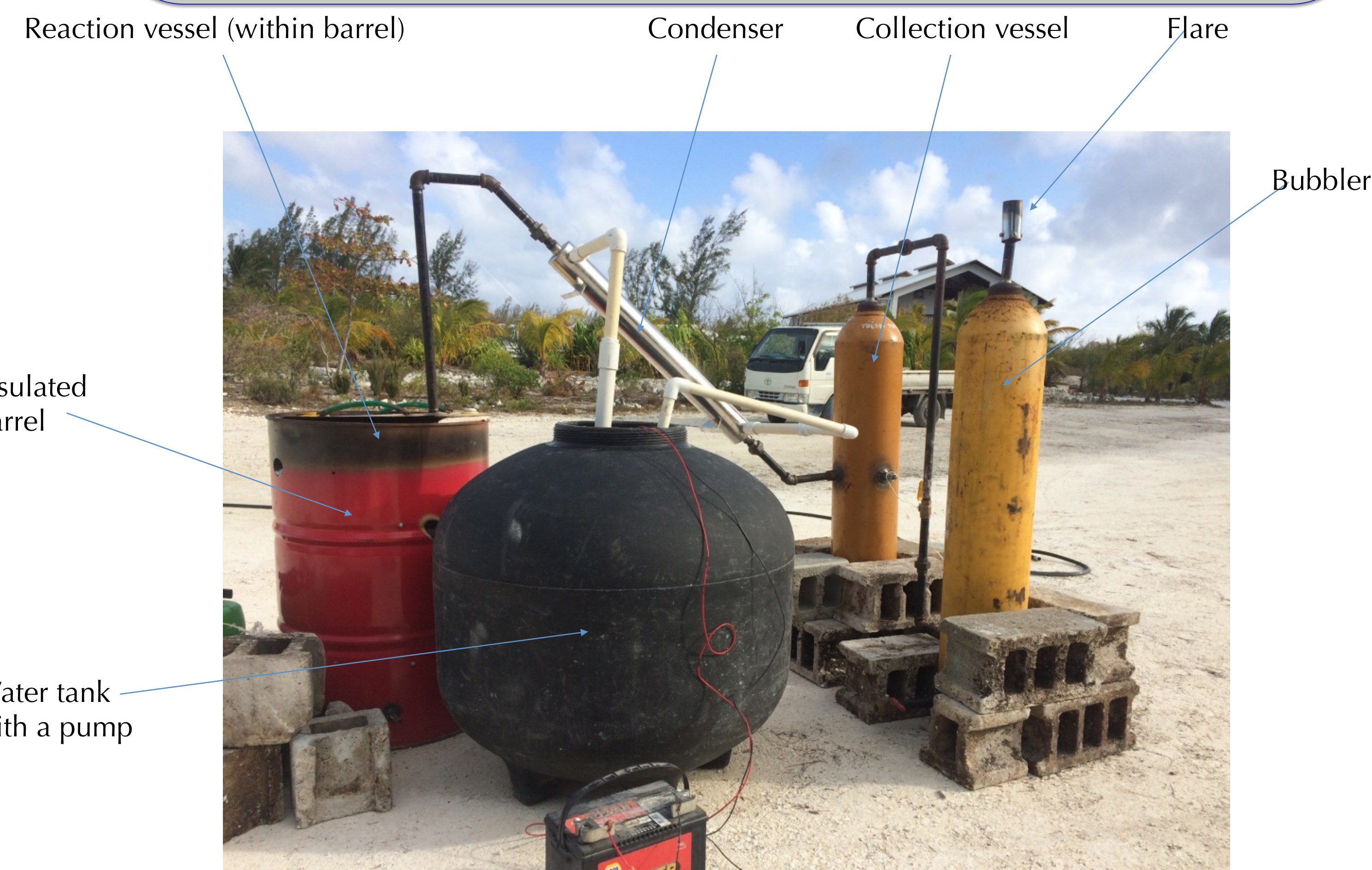
Figure 3: System components

The system was created from scratch without instructions. Construction of the pyrolyzer included metal-working such as angle grinding, drilling, welding, and pipe threading. There was an abundance of troubleshooting during the creation of the system, particularly over the framework and insulation of the reaction vessel. Instead of purchasing an expensive gasket, a copper gasket was created from repurposed waste. The plastic pyrolysis research team hopes to pyrolyze The Island School's weekly plastic waste, generate replicable data, and extract synthetic fuel from each experiment. Last term created a small lab-scale system that successfully pyrolyzed approximately 100 grams of waste plastic, yielding about 60-80 milliliters of synthetic fuel per batch. With 60 pounds of shredded waste plastic from the recycling center at The Island School, it is hypothesized that the system could yield approximately 5.7 gallons of synthetic fuel per batch.