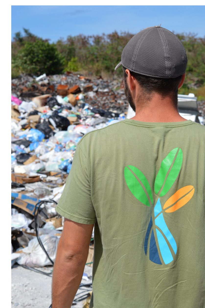
Figure 5: Tarpum bay landfill